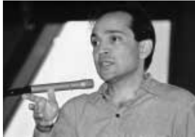
Vikram Seth reading from An Equal Music

The music for the evening's reading was carefully chosen by Vikram to match episodes from his novel and the pleasing synergy between Vikram's eloquent readings and the playing of music made for an enriching evening which all present will long remember.