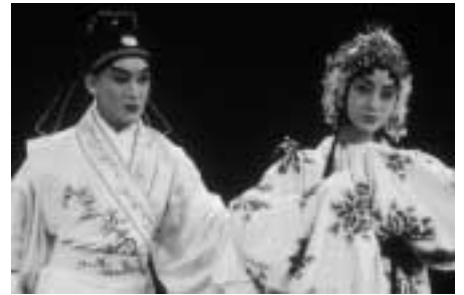
The talk of this year's Perth International Arts Festival: The Peony Pavilion.