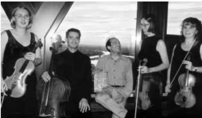
Vikram Seth enjoying the company of the Beldere String Quartet