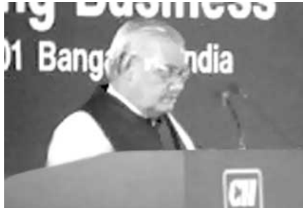
Shri Atal Bihari Vajpayee, Honorable Prime Minister of India at the Asia Society's 12th Annual Corporate Conference

It was recognised that Asia was a market that was huge and diverse with multiple languages and cultures and was one where the use of infocomm technologies varied widely. Some Asian countries already had some of the highest per population PC ownership,