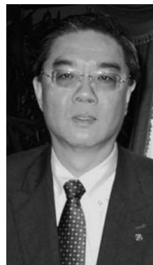
H.E. Mr Ong Keng Yong, ASEAN Secretary-General

Mr Ong visited Australia as a guest of the Australian government to commemorate the 30th Anniversary of Australia's dialogue partnership with ASEAN.