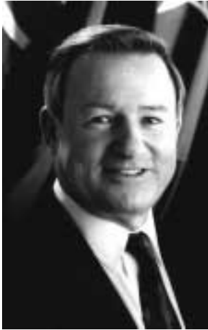
New Zealand Prime Minister, the Rt. Hon. Jim Bolger