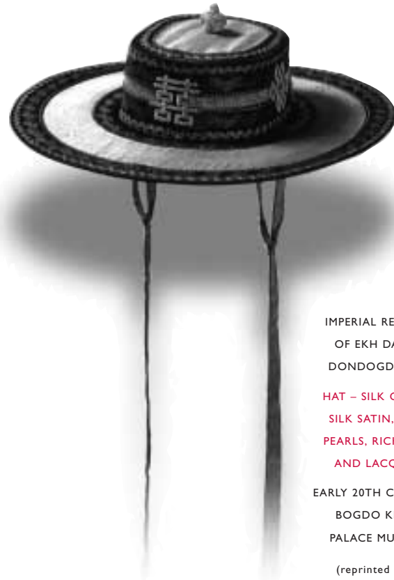
IMPERIAL REGALIA OF EKH DAGIN DONDOGDULAM