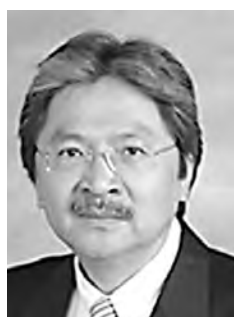
The Hon John C Tsang JP, Financial Secretary, Hong Kong SAR

Sponsored by Blake Dawson Melbourne, 17 July 2008