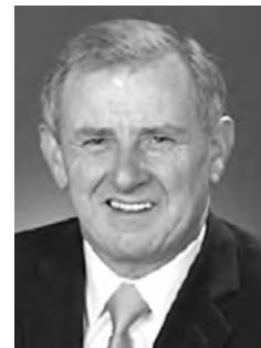
The Hon Simon Crean MP, Minister for Trade