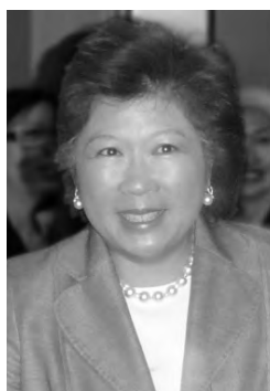
H.E. Dr Mari Elka Pangestu, Minister of Trade, Indonesia

Sponsored by Commonwealth Bank of Australia Sydney, 3 October 2008