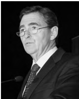
The Hon John Brumby MP, Premier of Victoria